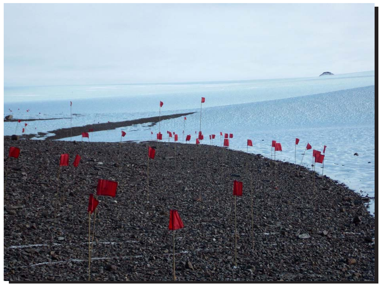
A view of "Meteorite Beach", one of many segments of moraine at the Davis-Ward icefields exhibiting a very dense meteorite concentration. Each flag marks the location of at least one meteorite.

And at season's end there is no longer any disagreement about the future workload at Davis-Ward; we'll be going back there for at least one full season and maybe more than once. Any region of these icefields, moraine or not, has the potential to surprise us with significant meteorite concentrations. While reconnaissance generally gives us an idea of the potential for meteorite recovery, there is no way to predict where amazing concentrations or occurrences might be, and clearly Davis-Ward is a place we can't afford to trust our instincts; we simply have to put our boots on the ice and go have a look.