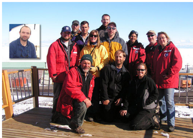
2005-2006 ANSMET field teams:

The 2005-2006 ANSMET field season went like clockwork but was a lean one for meteorites - only 171 for the systematic searching team in the Miller Range and 67 for the reconnaissance group exploring several blue ice patches south