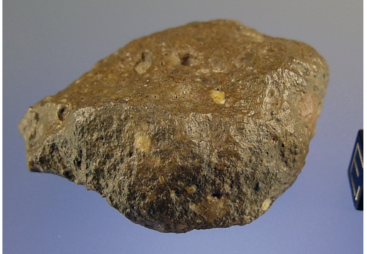
Figure 1: Image taken of Shisr 161 in the.