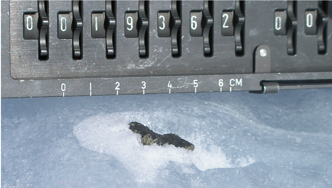
Figure 1: Photo of LAR 06638 as discovered in the Larkman Nunatak region of Antarctica in 2006.