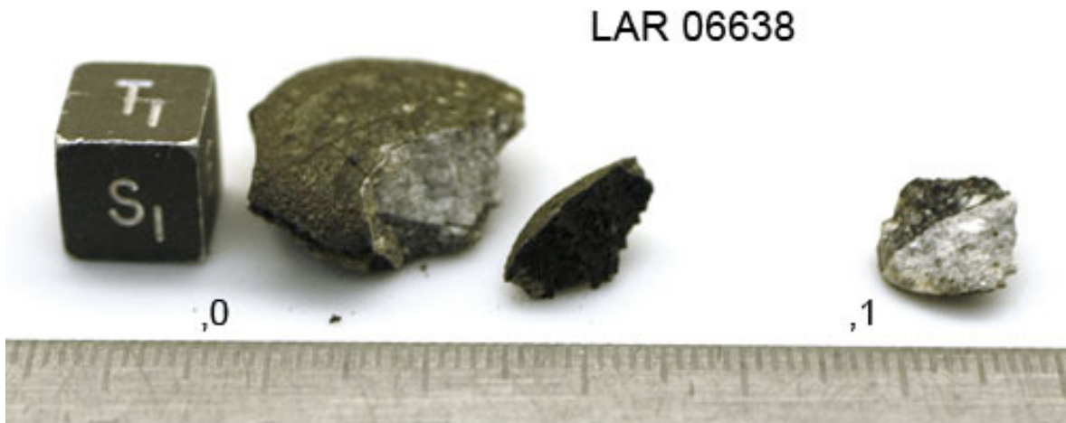
Figure 3: JSC lab photo of LAR 06638 with 1 cm cube and scale bars below.