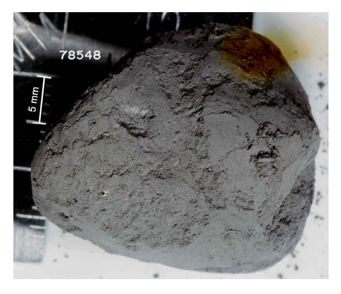
Figure 1: Photograph of 78548. Scale is 1 cm. S73-33400.

Laul and Schmitt (1975c) have reported the chemical composition of 78548 (Table 1 and Fig. 3). It has a chemical composition exactly like that of the rake soil (78501).