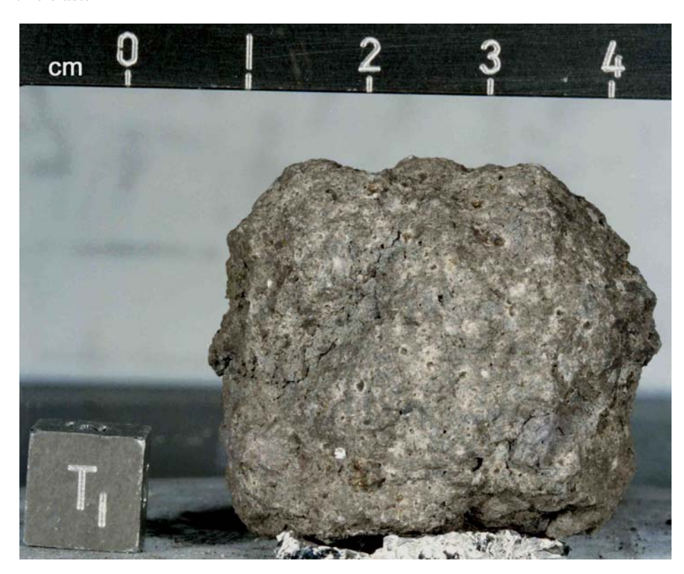
Figure 1: Photograph of 77518. Cube is 1 cm. S73-19143.

Warner et al. (1978) report that one edge of the chip that they studied had an area of Si-AI-K-rich glass (80% SiO<sub>2</sub>, 12% Al<sub>2</sub>O<sub>3</sub>, and 8% K<sub>2</sub>O) with a gradational boundary with the breccia matrix.