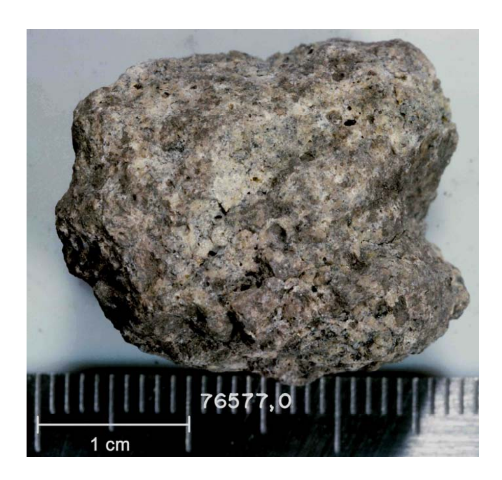
Figure 1: Photograph of 76577. Scale bar is marked in mm. S73-19645.

Simonds and Warner (1981) point out that this poikilitic breccia has less FeO and more MgO than the boulder at Station 6. They speculate that it may be similar to the lithology represented by large sample 76055.