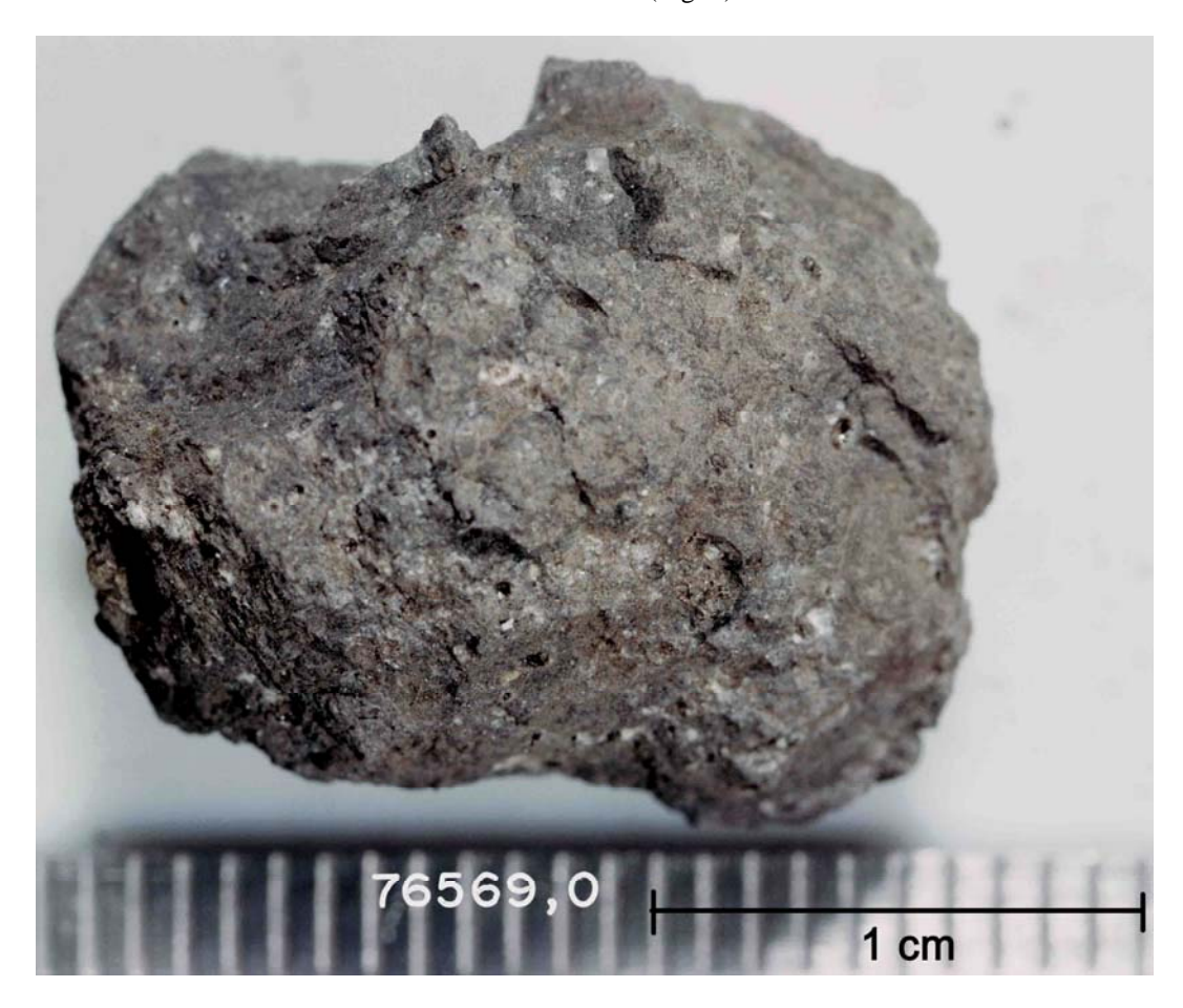
Figure 1: Photograph of 76569. Scale bar is marked in mm. S73-19635.

Simonds and Warner (1981) report a preliminary analysis of 76569 (Table 1).