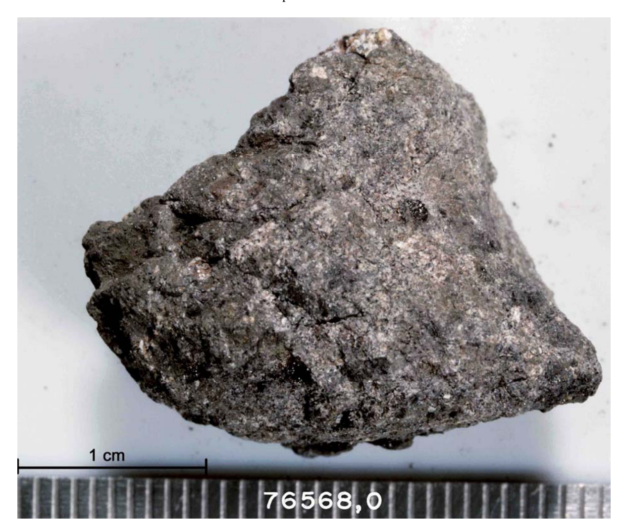
Figure 1: Photograph of 76568. Scale bar is in mm. S73-19642.

fragment has been determined by Roy Brown (unpublished, in Simonds and Warner, 1981). The high TiO<sub>2</sub> content (~11%) is consistent with the ilmenite abundance in the thin section.