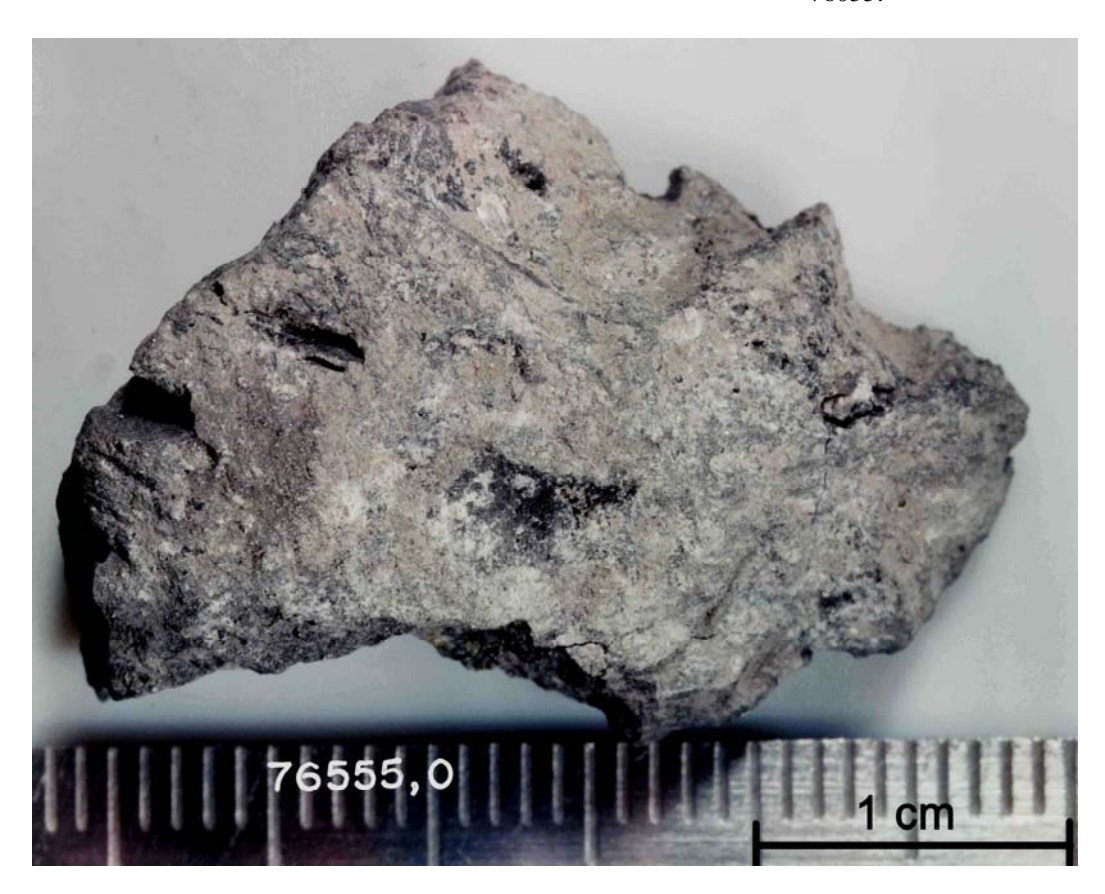
Figure 1: Photograph of 76555. Scale bar is in mm. S73-19618.

Simonds and Warner (1981) point out that this poikilitic impact melt breccia has less Fe and more Mg than the boulder at Station 6 (Table 1), and is similar to sample 76055.