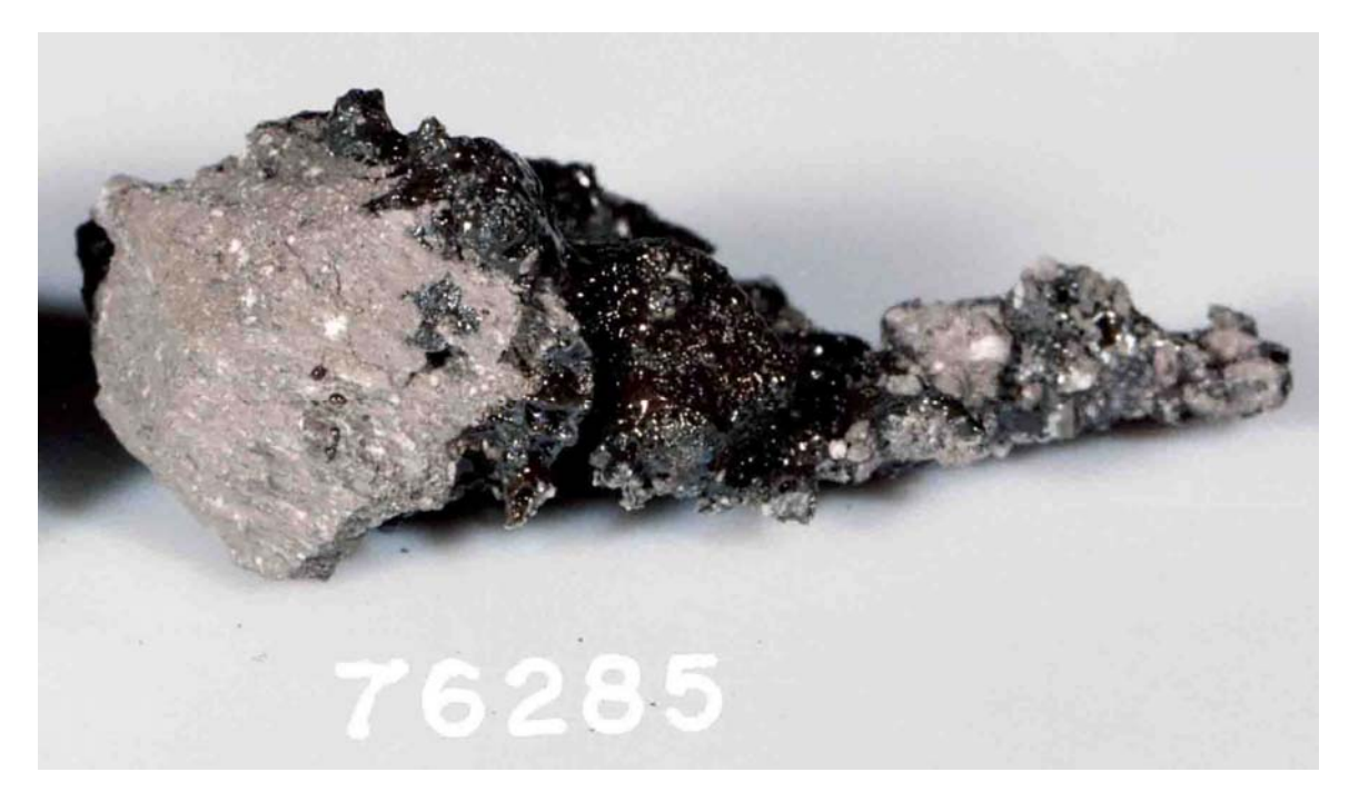
Figure 2. The other side of 762 35. S73-20181.