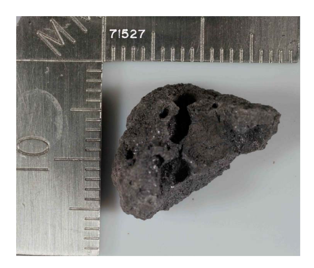
Figure 1: Hand specimen photograph of 71527. Small divisions on scale are in millimeters.

Of the original 2.19g of 71527,0, approximately 2.04g remains. 71527,1 was used for INAA and thin section ,3 was taken from this irradiated sample.