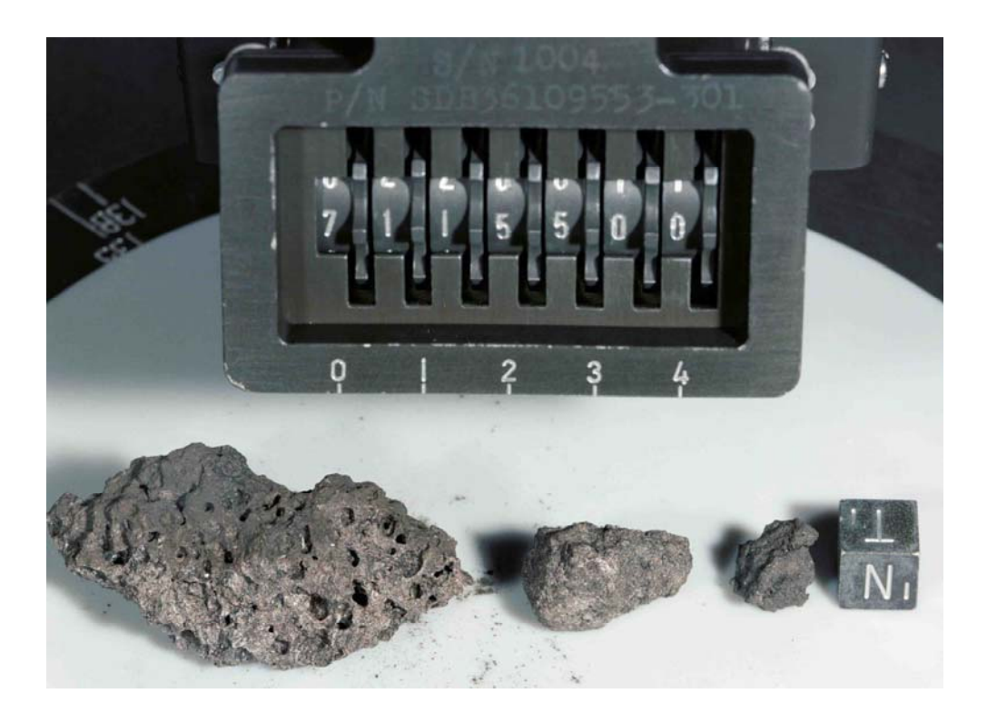
Figure 1: Hand specimen photograph of 71155,0, from which two pieces have broken off Cubic scale = 1 \text{ cm}^3 .

During the preparation of this catalog, we examined thin sections 71155,28 and,29.71155 is a fine-grained (0.1-0.2mm) basalt containing olivine (up to 0.4mm) and ilmenite (up to 1mm long). Ilmenite exhibits "sawtooth" margins. Crulvospinel is usually present (~0.1mm) as inclusions in olivine,