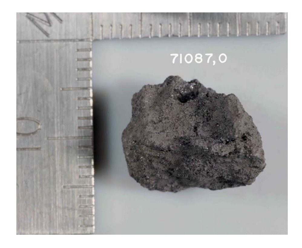
Figure 1: Hand specimen photograph of 71087,0.

Fo, max.), but between grains the compositional variation is more pronounced (Fo<sub>58-71</sub>). Plagioclase exhibits only minor variations either core-to-rim or between grains (An<sub>81-87</sub>). Pyroxene compositions (Fig. 2) range from titan-augite to pigeonite (with compositional intermediates). Fe enrichment is noted towards the rims. Al/Ti ratios are constant at --2 and Cr<sub>2</sub>O<sub>3</sub> decreases with decreasing pyroxene MG#. Cr-ulvospinel (Cr/(Cr+Al) = 65-76; MG# = 4-18) and ilmenite (MG# = 2-12) both exhibit moderate compositional variations. Crulvospinel becomes more Aland Fe-rich from coreto-rim, but ilmenite variation is primarily between grains. No armalcolite is present.