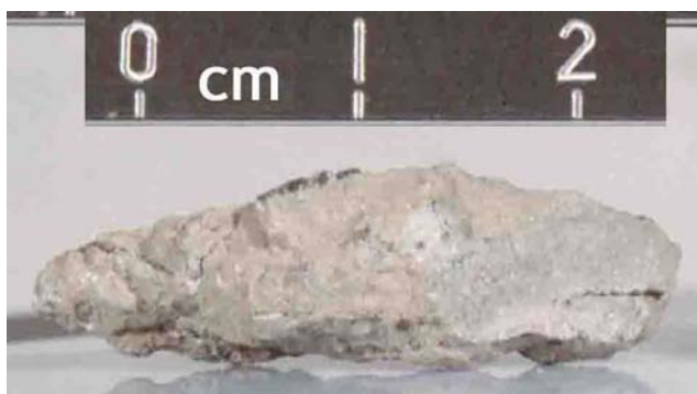
FIGURE 1. S-72-38977.

INTRODUCTION: 67945 is a light gray, fine-grained impact melt (Fig. 1) with a subophitic to poikilitic texture and a small piece of adhering glass coat (?) and veins. It was collected from the regolith at the east-west split of House and Outhouse Rocks (see 67915, Fig. 1). Its orientation is unknown and it lacks zap pits.