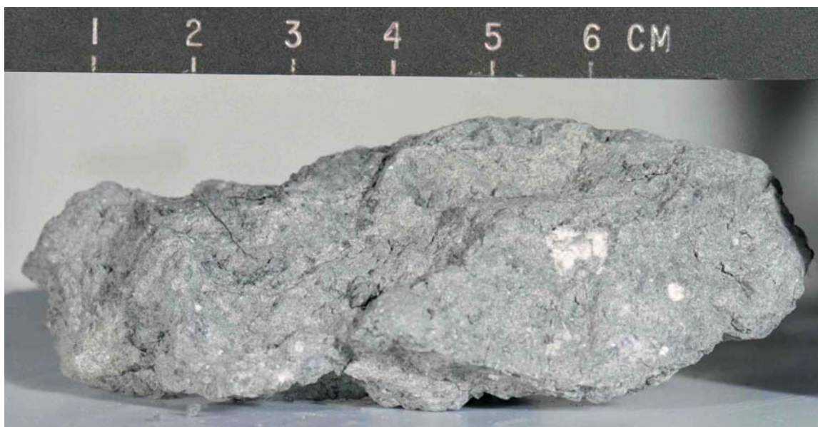
FIGURE 1. S-72-37771.

INTRODUCTION: 67937 is a medium gray, fine-grained impact melt cut by glass veins (Fig. 1). It is coherent and slabby. Sharp variations in grain size are apparent macroscopically. It was chipped from Outhouse Rock (see 67915, Fig. 1) to sample a shatter cone, as were 67935 and 67937. Its orientation is not precisely known but a few zap pits on one surface indicate the exterior.