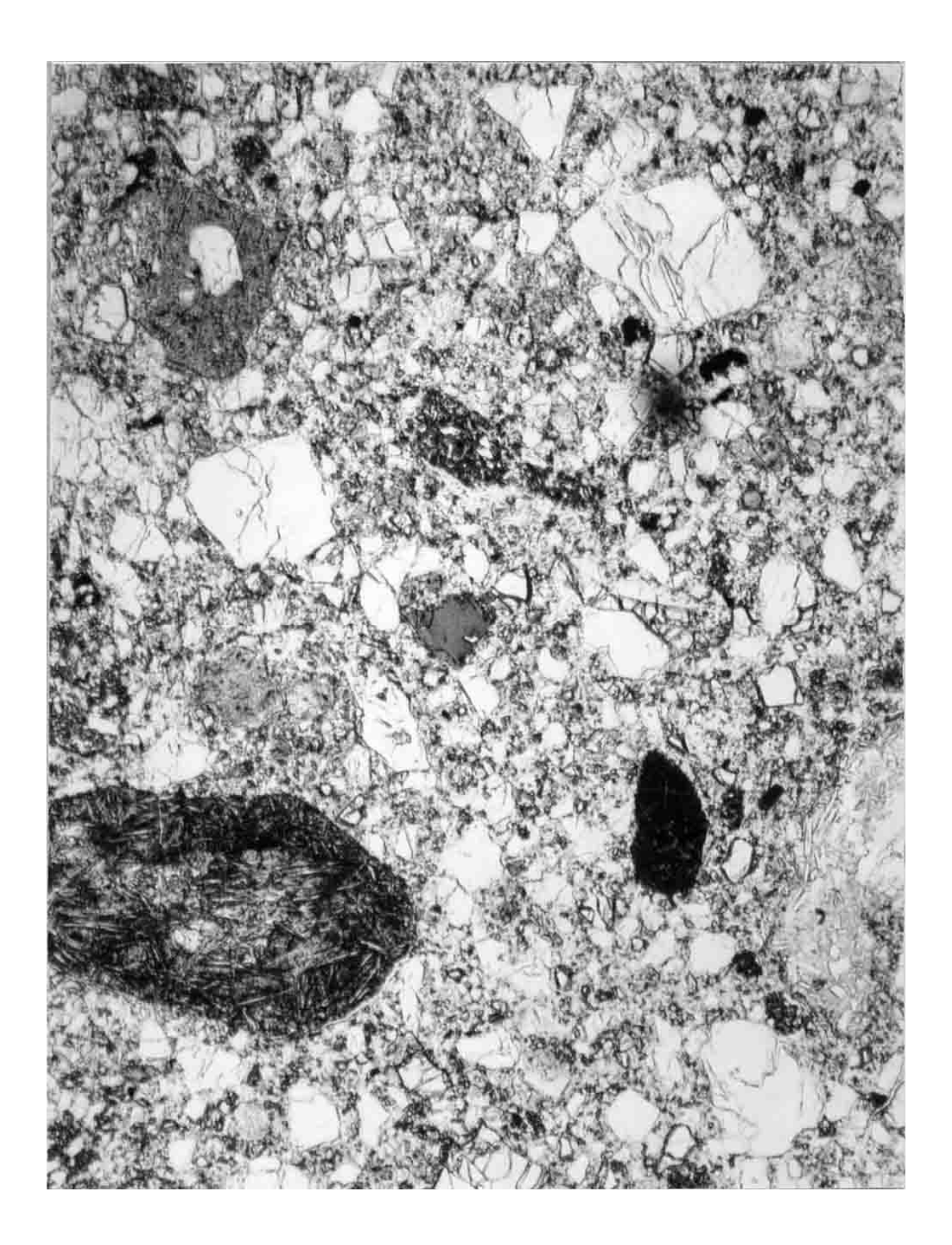
FIGURE 2. 66036,5. General view, ppl. Width 2 mm.