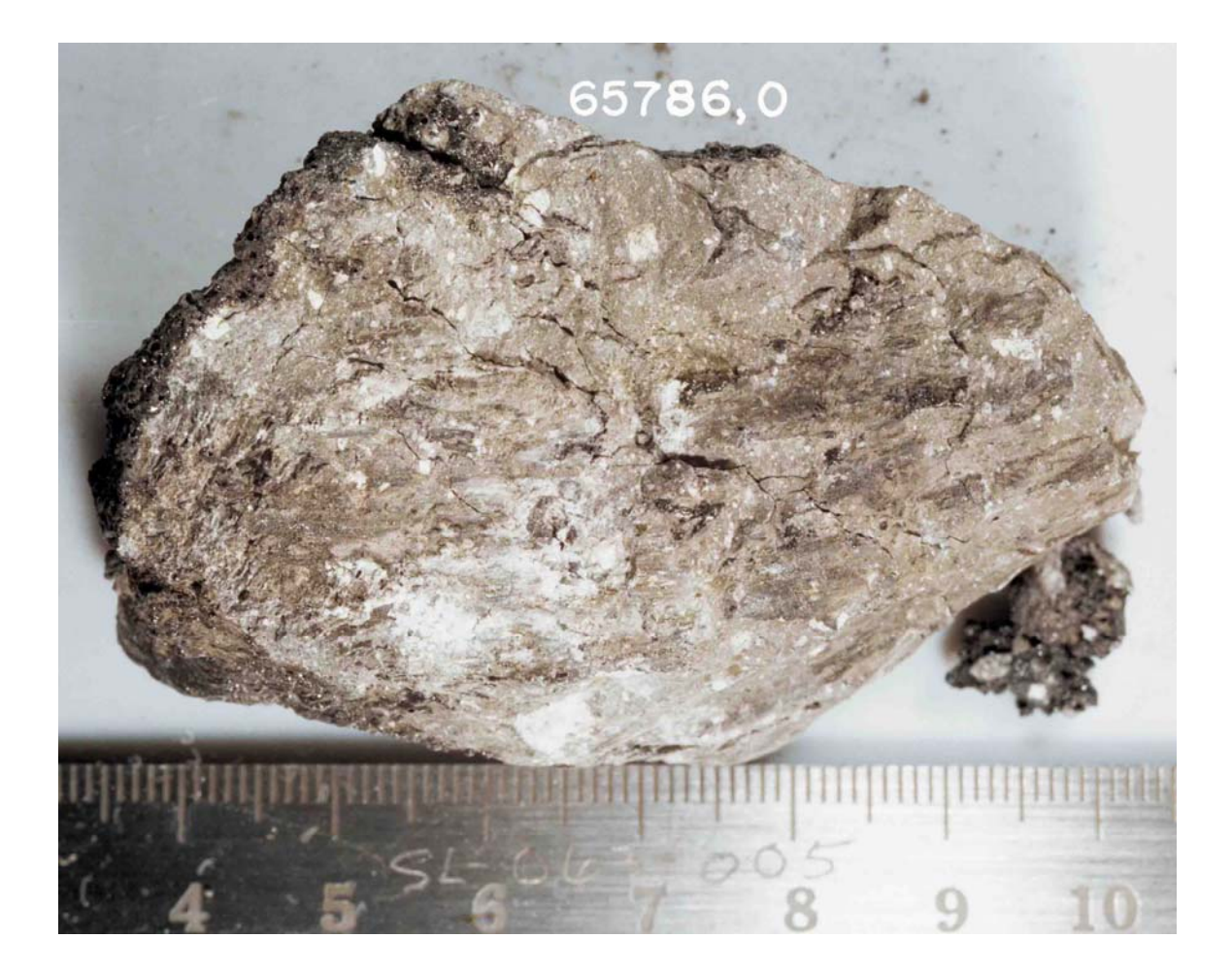
FIGURE 1. Smallest scale division in mm. S-72-48812.

This rock is a rake sample from the rim of a small, subdued crater on Stone Mountain. Zap pits are absent.