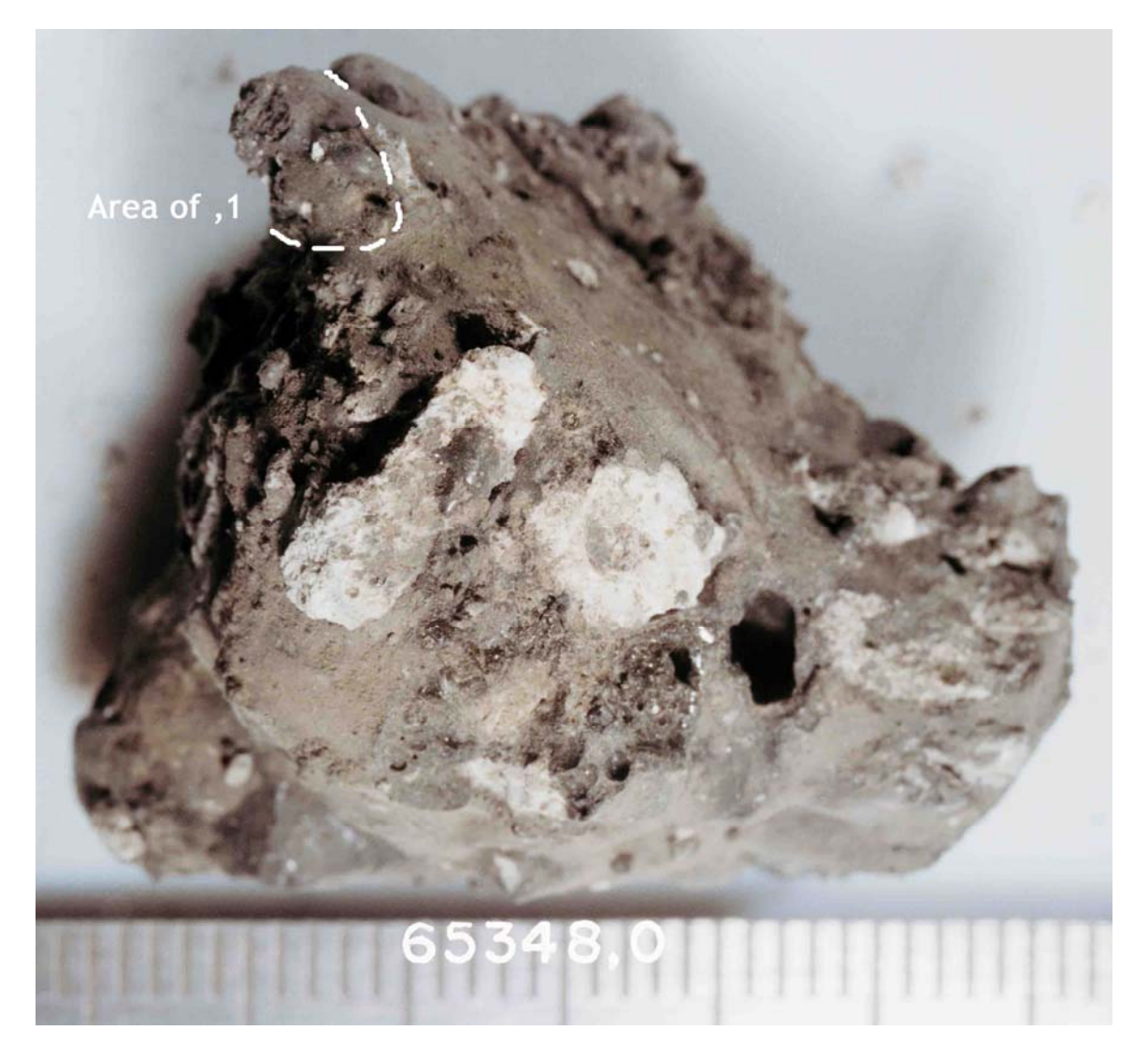
FIGURE 1. Smallest scale division in mm. S-72-47671.

<u>PETROLOGY</u>: A brief petrographic description of the dark matrix is provided by Warner et al. (1976b). Abundant mineral and lithic clasts reside in a glassy but fragmental matrix (Fig. 2). Clasts are generally smaller than in fragmental breccias.