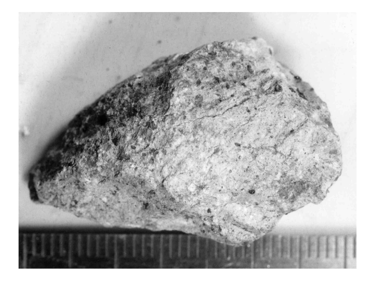
FIGURE 1. Smallest scale division in mm.

<u>PROCESSING AND SUBDIVISIONS</u>: In 1973 several chips were allocated to Wasserburg for geochronology (,1 3.08 g) and to Keil for petrography (,2 0.10 g).