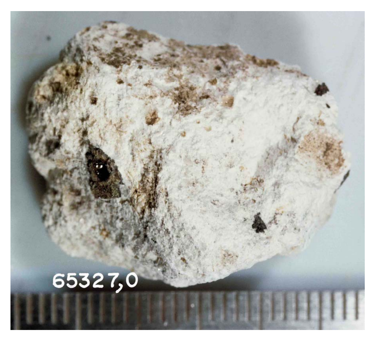
FIGURE 1. Small scale division in mm. S-72-47678.

<u>PETROLOGY</u>: Warren and Wasson (1978) provide a brief petrographic description and mineral compositions. Plagioclase (An<sub>97</sub>, up to 1.5 mm long) composes ~99% of the rock, with the remainder low-Ca pyroxene (Wo<sub>2</sub>En<sub>62-67</sub>). Rare grains of metal were observed macroscopically (Keil et al., 1972). No signs of recrystallization are present (Fig. 2).