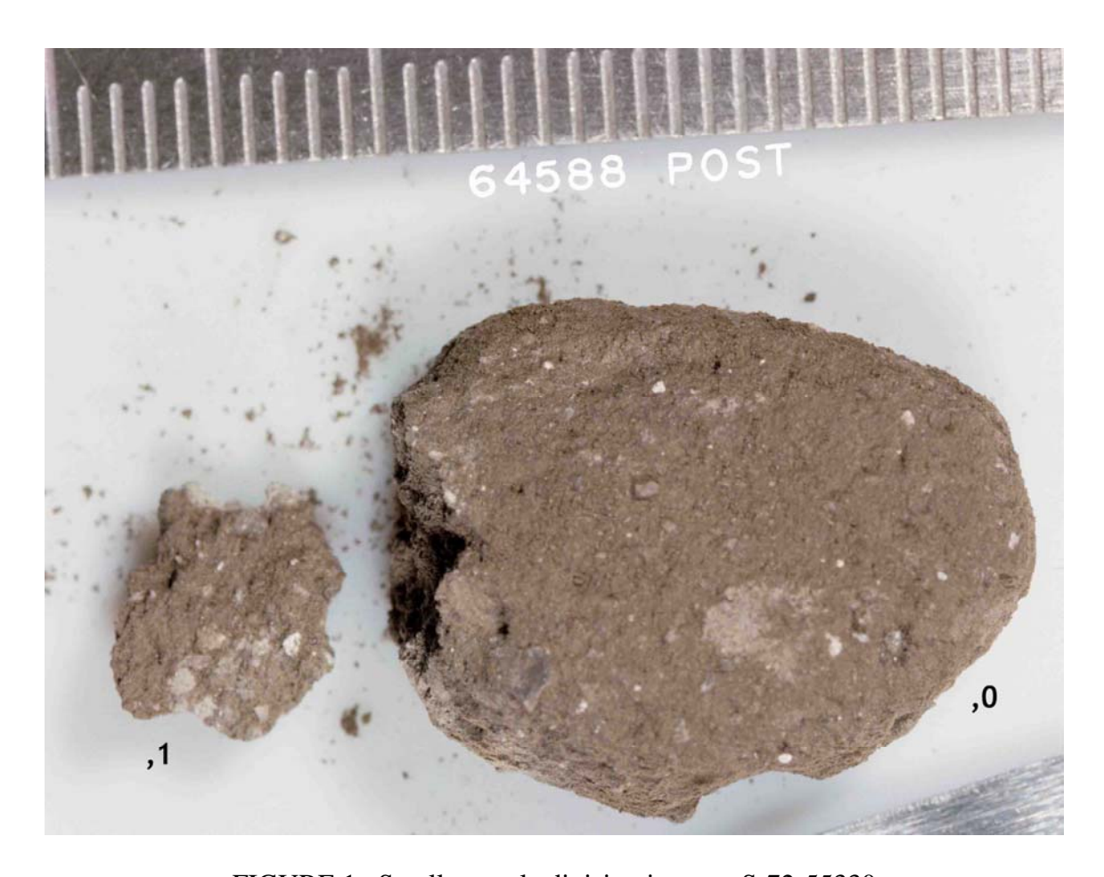
FIGURE 1. Smallest scale division in mm. S-72-55330.

<u>INTRODUCTION</u>: 64588 is a medium gray, friable, clastic breccia (Fig. 1). It is a rake sample from the rim of a subdued doublet crater on Stone Mountain. Zap pits are absent.