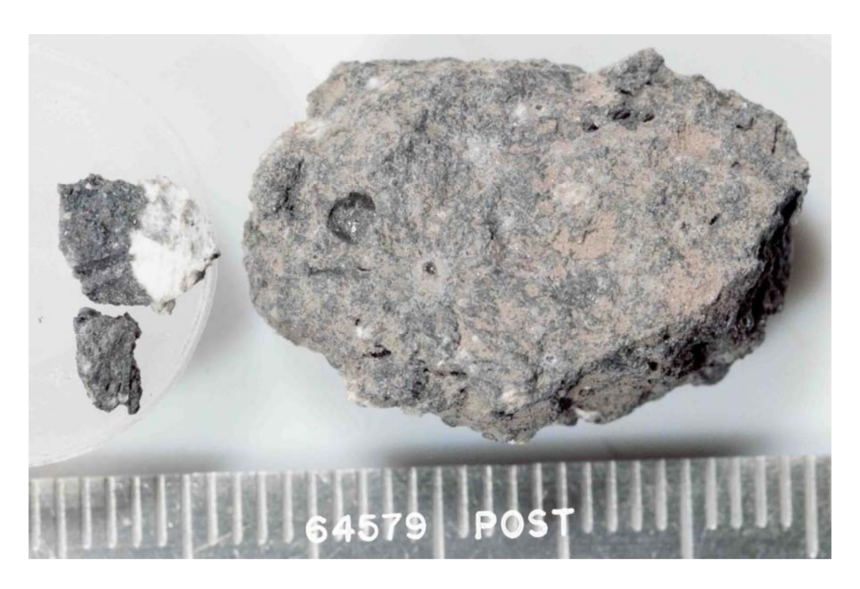
FIGURE 1. Smallest scale division in mm. S-72-55368.

<u>INTRODUCTION</u>: 64579 is a coherent, dark gray, aphanitic impact melt (Fig. 1). It is somewhat vesicular with a few zap pits on some surfaces. It is a rake sample from the rim of a subdued doublet crater on Stone Mountain.