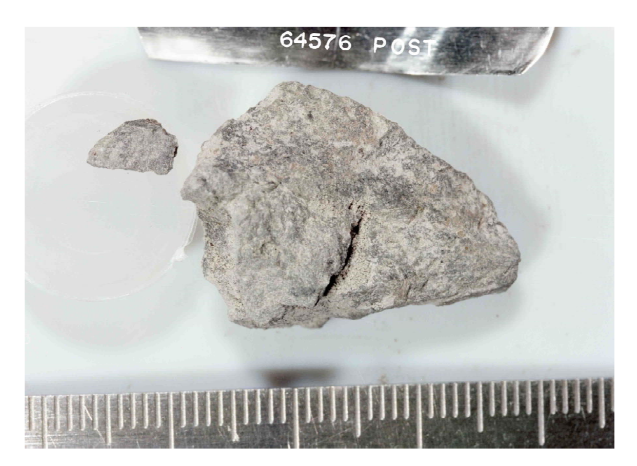
FIGURE 1. Smallest scale division in mm. S-72-55363.

<u>INTRODUCTION</u>: 64576 is a coherent, light gray, basaltic impact melt (Fig. 1). It is a rake sample collected from the rim of a subdued doublet crater on Stone Mountain. Zap pits are absent.