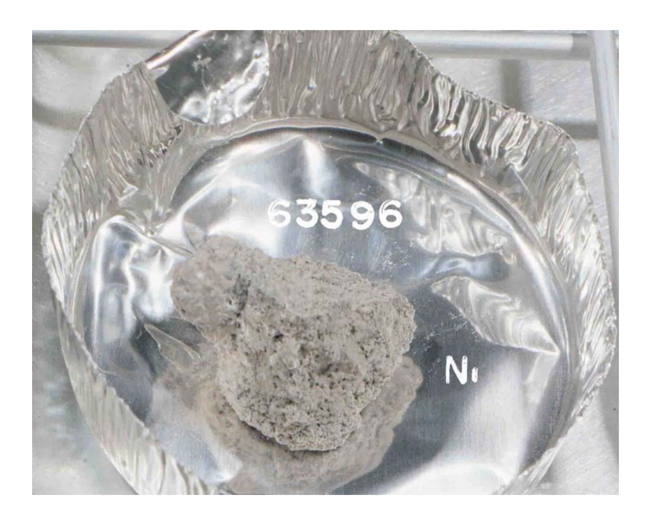
FIGURE 1. Aluminum cup bottom is 2 inches in diameter. S-72-42082.

<u>PROCESSING AND SUBDIVISIONS</u>: Two small chips (,1) were potted together and made into thin sections ,3 - ,5.