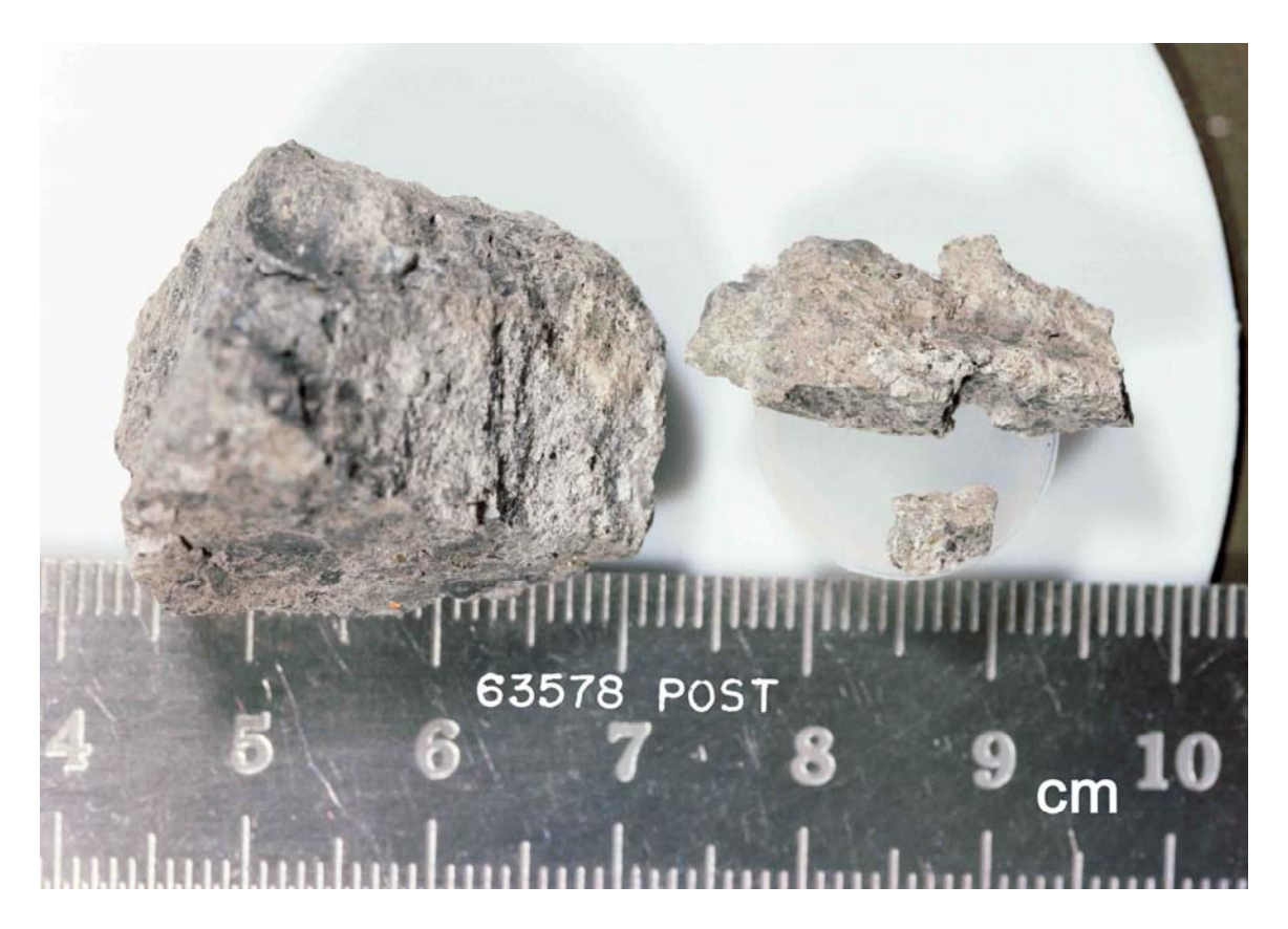
FIGURE 1. Smallest scale division in mm. S-72-55400.

<u>INTRODUCTION</u>: 63578 is a fine-grained, coherent polymict breccia (Fig. 1) which appears to be bonded with either glass or a fine-grained melt. It is angular with flat sides. It is a rake sample with zap pits.