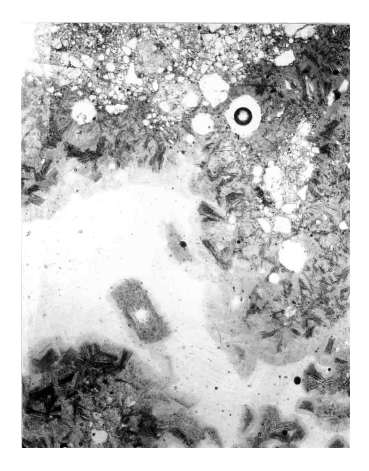
FIGURE 2. 63575,4, general view, ppl. Width 2 mm.