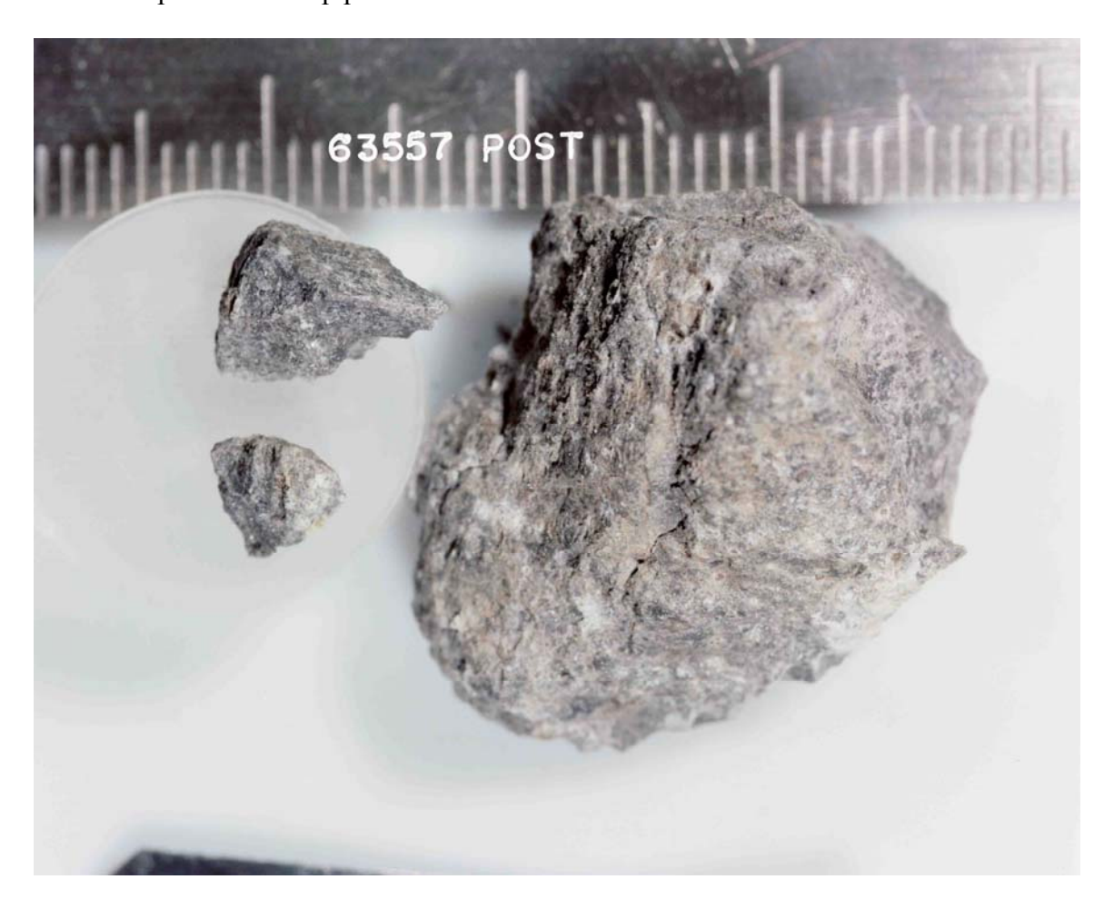
FIGURE 1. Smallest scale division in mm. S-72-55382.

<u>INTRODUCTION</u>: 63557 is a medium dark gray, fine-grained impact melt (Fig. 1). It is a rake sample and has zap pits.