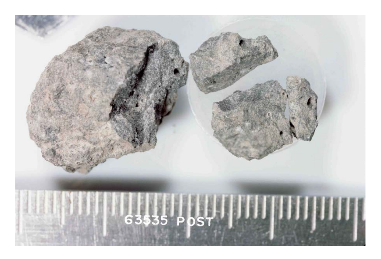
FIGURE 1. Smallest scale division in mm. S-72-55391.

<u>INTRODUCTION</u>: 63535 is a dark gray, vesicular, fine-grained basaltic impact melt (Fig. 1). It is a rake sample and has zap pits.