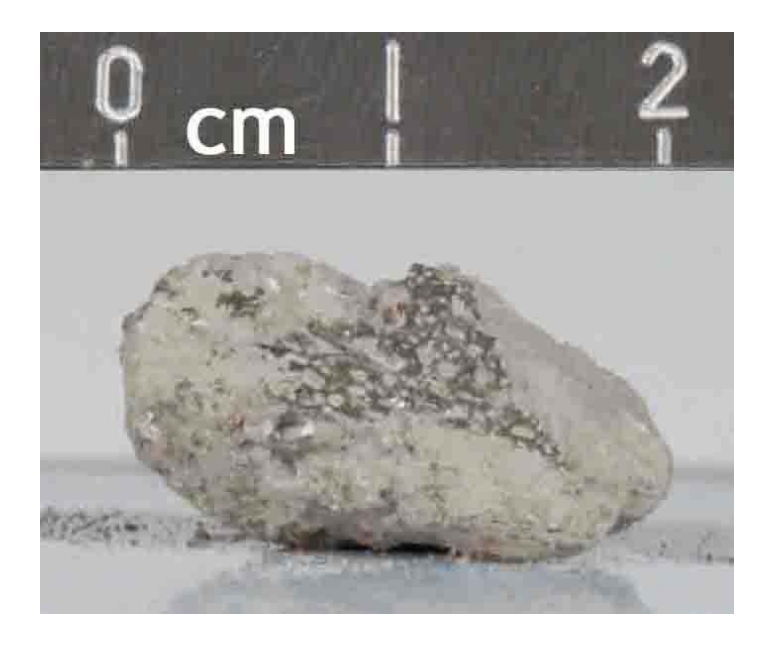
FIGURE 1. S-72-38969.

<u>PROCESSING AND SUBDIVISIONS</u>: A single chip (,1) of the breccia was taken to make thin sections ,13 and ,14.