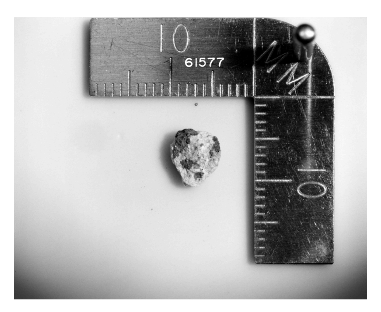
FIGURE 1. S-73-17118.

<u>PROCESSING AND SUBDIVISIONS</u>: In 1973 four small chips (,1) were removed and allocated to Phinney for petrography.