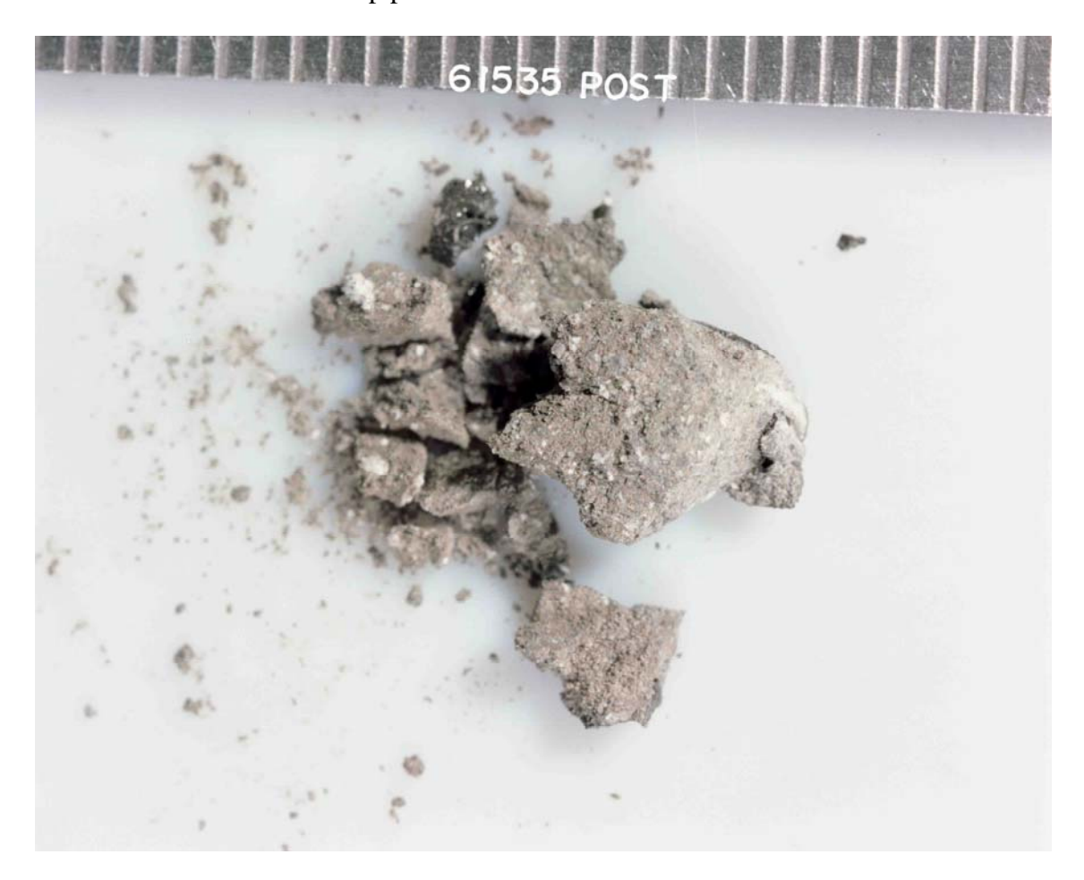
FIGURE 1. Smallest scale division in mm. S-72-55318.

<u>INTRODUCTION</u>: 61535 is a moderately coherent, light gray, clastic breccia with a thin coat of dark glass on one surface (Fig. 1). It is a rake sample collected about 45 m northeast of Plum Crater. Zap pits are rare or absent.