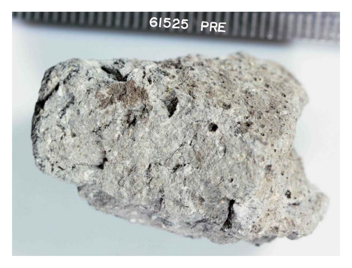
FIGURE 1. Smallest scale division in mm. S-72-55332.

<u>INTRODUCTION</u>: 61525 is a moderately friable, medium gray, polymict breccia with considerable glass in the matrix (Fig. 1). It is a rake sample collected ~45 m northeast of Plum Crater. Zap pits are abundant on one surface, absent on others.