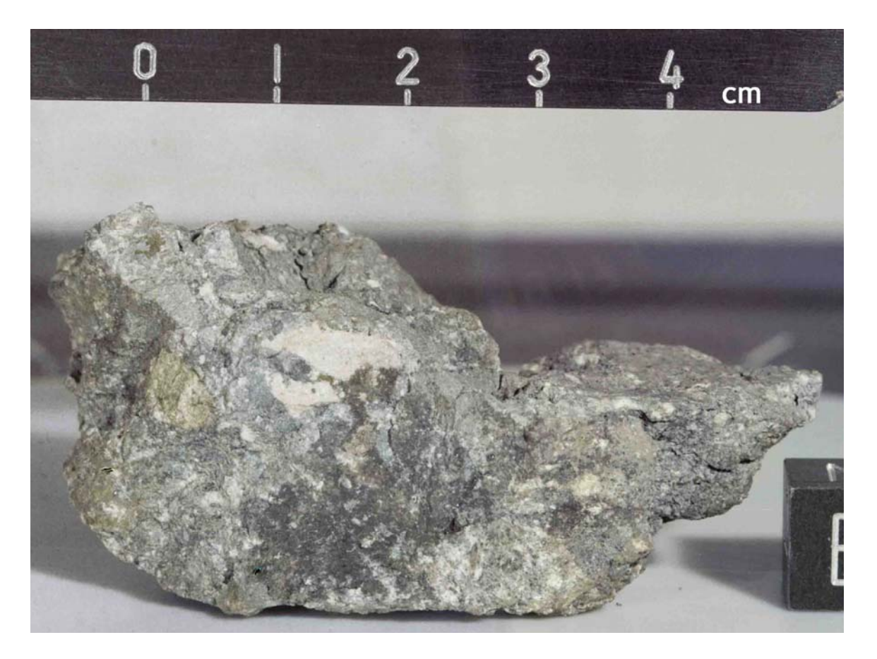
FIGURE 1. 61155,0. S-72-38371.

<u>PETROLOGY</u>: 61155 is a glassy impact melt that is very clast-rich (Fig. 2). In places the matrix texture approaches poikilitic. Oikocrysts (~0.3 mm) are separated from one another by a concentration of relatively large clasts of plagioclase. Glassy mesostasis is abundant. Clasts include fragments of basaltic impact melt and cataclastic anorthosite. Fe-metal, troilite and ilmenite are accessory phases.