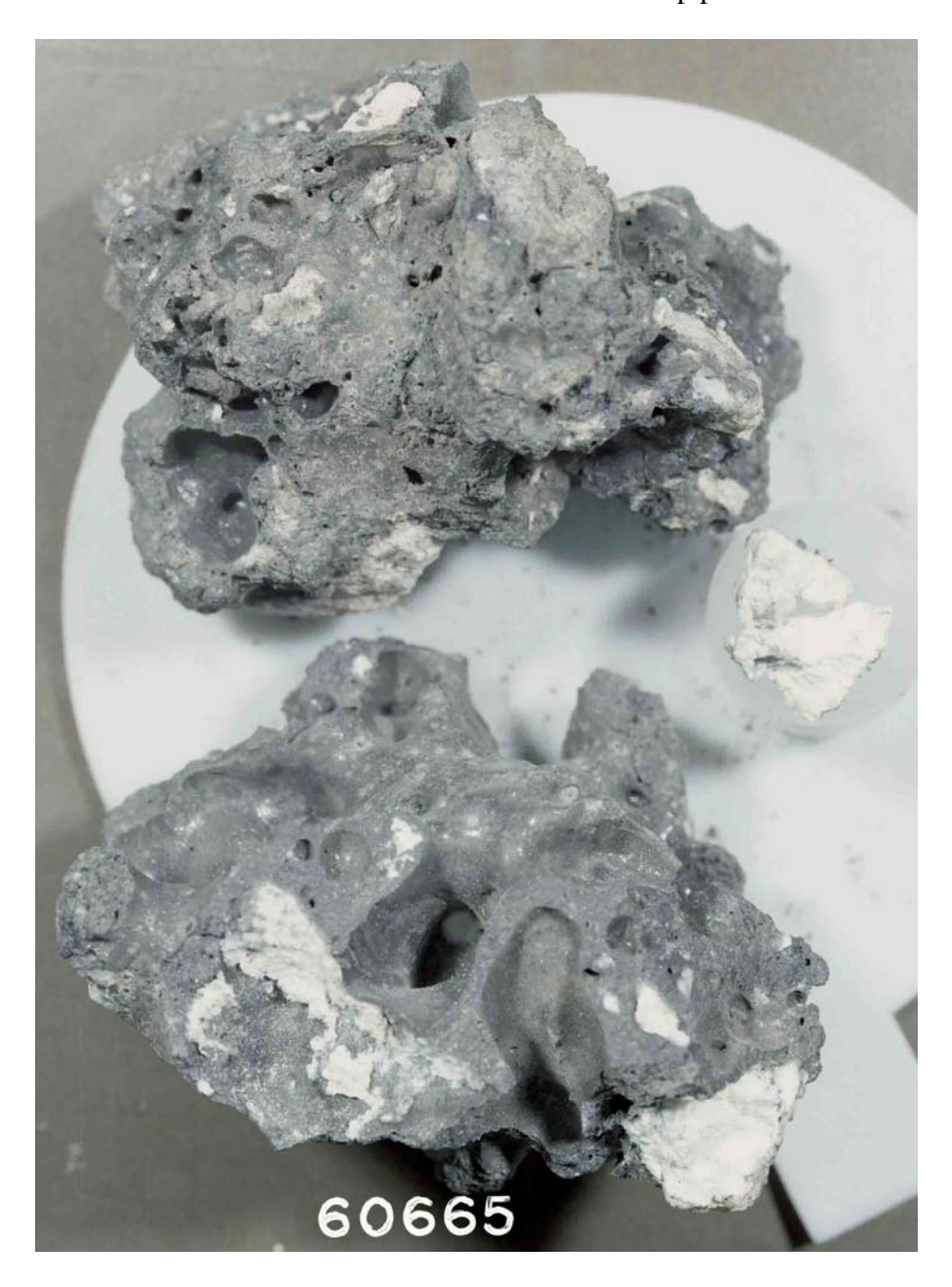
FIGURE 1. S-73-20497. Larger pieces are about 6 cm across.

<u>INTRODUCTION</u>: 60665 is a vesicular glass containing small white clasts (Fig. 1), at least one of which is a cataclastic anorthosite. 60665 is a rake sample collected about 70 m west southwest of the Lunar Module. It has a few small zap pits.