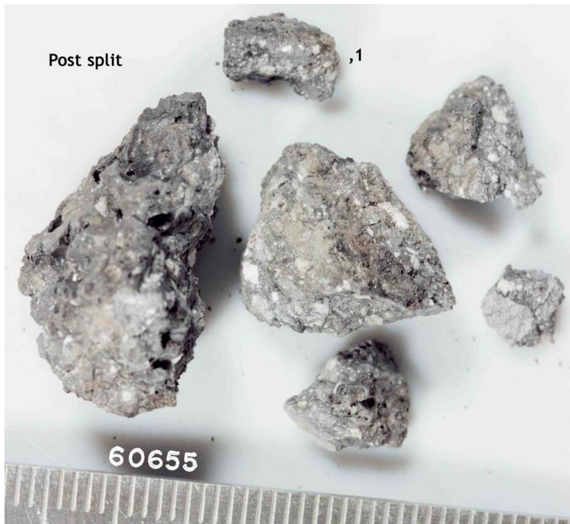
FIGURE 1. Smallest scale division in mm. S-73-20463.

INTRODUCTION: 60655 is a medium gray, coherent, glassy impact melt (Fig. 1). Vesicles account for ~15% of the rock (Keil et al., 1972). It is a rake sample collected about 70 m west southwest of the Lunar Module. Zap pits are rare.