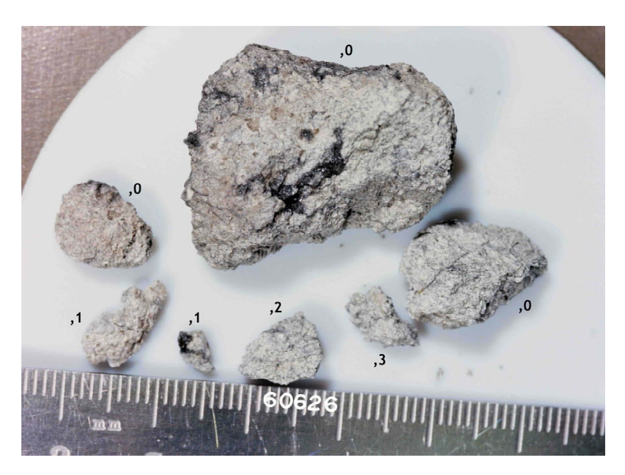
FIGURE 1. S-73-20493.

<u>PETROLOGY</u>: Warner et al. (1976b) provide a brief petrographic description and mineral compositions. 60626 is poikilitic with irregularly shaped oikocrysts of dominantly low-Ca pyroxene. Unlike most Apollo 16 poikilitic impact melts the plagioclase chadacrysts are anhedral and equant. Clasts of plagioclase are abundant (Fig. 2). Mineral compositions are shown in Figure 3 and tabulated by Dowty et al. (1976). Accessory phases include titaniferous spinel (~21% TiO<sub>2</sub>), ilmenite, and metal (11.0-1.7% Ni, 0.8% Co).