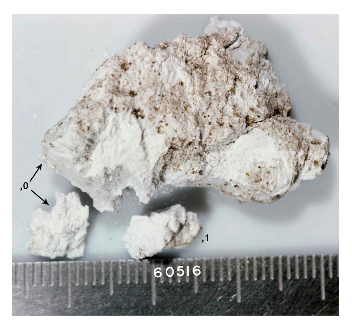
FIGURE 1. Scale in mm. S-73-20461.

<u>INTRODUCTION</u>: 60516 is a white, moderately coherent, cataclastic anorthosite (Fig. 1). It is a rake sample collected about 50 m southwest of the Lunar Module. Zap pits vary in abundance from few in some areas to many in others.