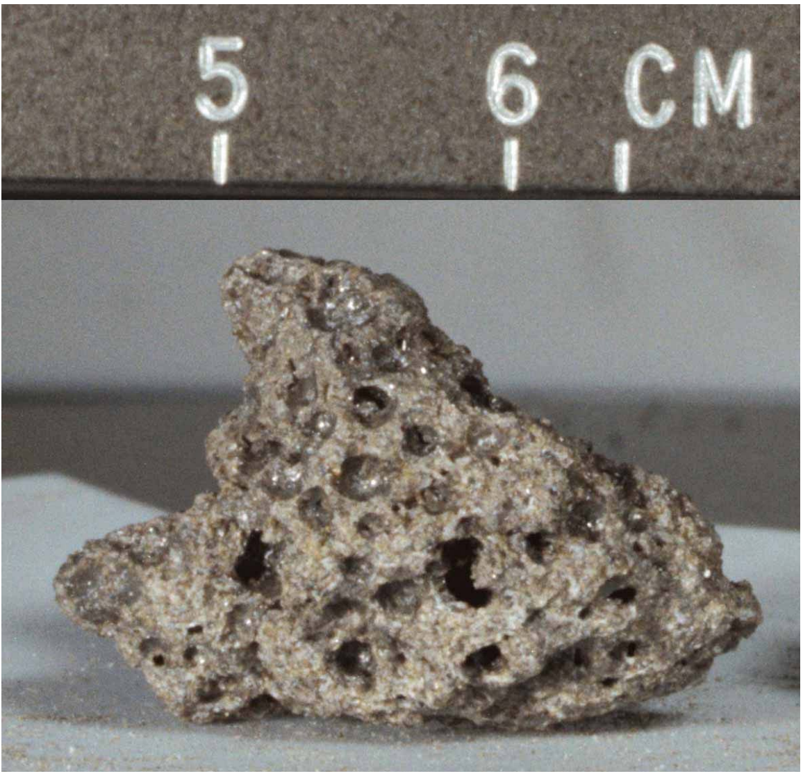
Figure 1. Pre-chip view of 15671. S-71-49721

<u>INTRODUCTION</u>: 15671 is a medium-grained, olivine-bearing mare basalt which is vesicular (Fig. 1). Olivines do not form phenocrysts. In chemistry, the sample is a primitive member of the Apollo 15 olivine-normative mare basalt group. Pyroxenes tend to be concentrated around some vesicles. One side is slightly rounded with several zap pits; others lack pits but have rare glass patches. 15671 was collected as part of the rake sample from Station 9A.