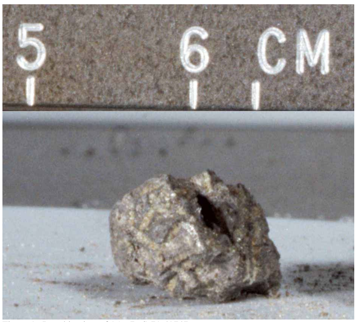
Figure 1. Pre-chip view of 15667. S-71-49747