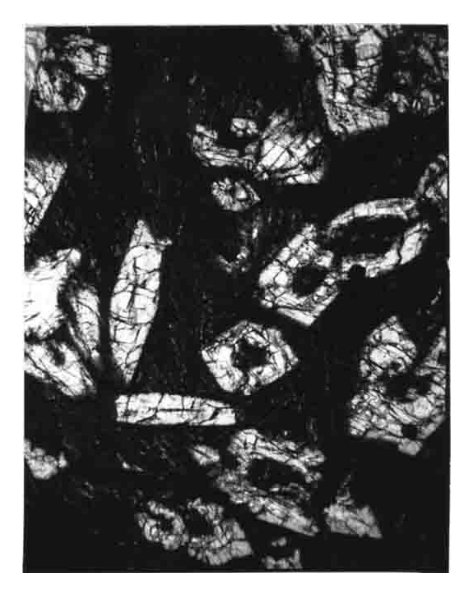
Figure 2. Photomicrograph of 15667,6. Width about 3 mm. Transmitted light. Most pyroxenes in thin sections seem to have been cut perpendicular to their long axes (indicating a lineation?) and no laths are seen.