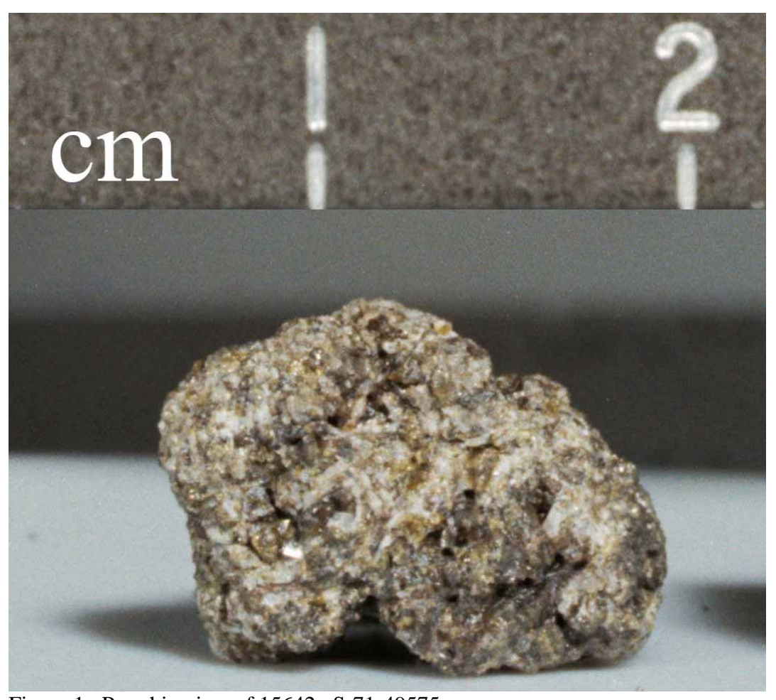
Figure 1. Pre-chip view of 15642. S-71-49575

<u>PROCESSING AND SUBDIVISIONS</u>: ,1 was chipped off and largely used to make thin sections ,1 and ,6. ,0 is now 1.60 g.