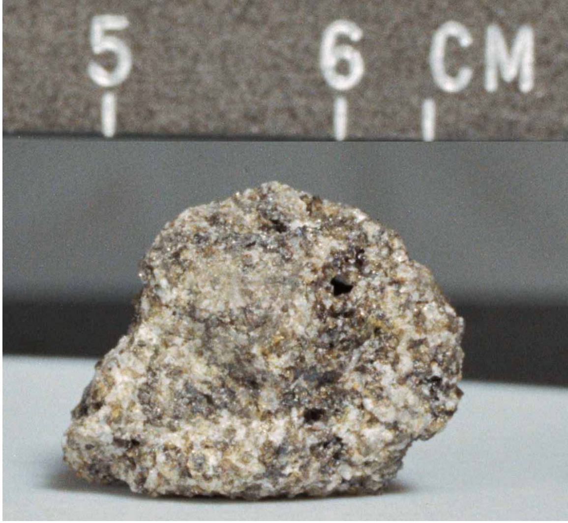
Figure 1. Pre-saw view of 15638. S-71-49559

<u>INTRODUCTION</u>: 15638 is a medium-grained, olivine-bearing mare basalt which contains some rugs but is not vesicular (Fig. 1). Yellow-green olivines are conspicuous macroscopically. The sample is tough and was collected as part of the rake sample at Station 9A.