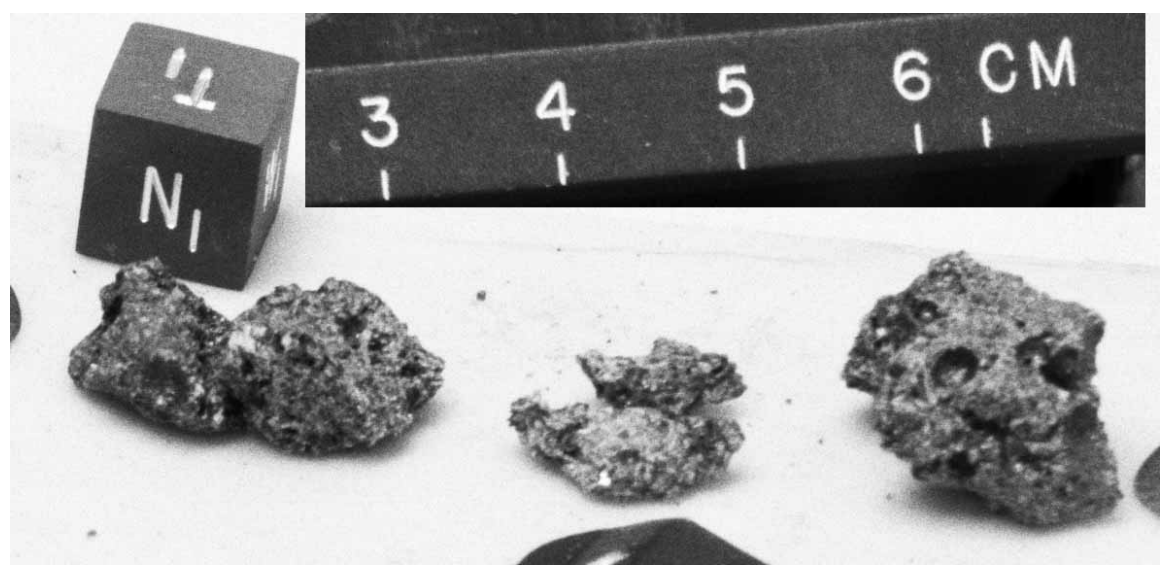
Figure 1. Post-split view of 15605. S-72-19842

<u>INTRODUCTION</u>: 15605 is a coarse-grained, olivine-bearing mare basalt which is very vesicular (Fig. 1). The olivine only rarely forms phenocrysts. In chemistry the sample is an average member of the Apollo 15 olivine-normative mare basalt group. The sample is brownish gray, stubby, angular, and tough, with the sparse yellow-green olivines visible macroscopically. The large (1 to 4 mm) vesicles compose about 15% of the rock. No zap pits were observed. 15605 was collected as part of the rake sample at Station 9A.