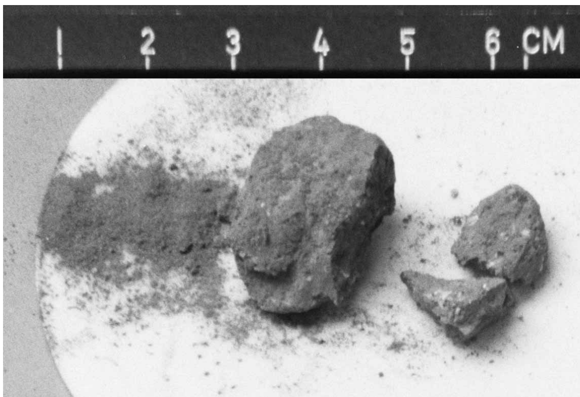
Figure 1. Post split view of 15342, with ,0 to the left. ,1 comprises the small chip and half of the third chip; ,2 is the top half of the third chip. S-71-57456

INTRODUCTION: 15342 is a regolith breccia with a dark glassy matrix (Fig. 1). It was dusty and moderately friable. Its texture and possible spalls suggested exposure, but zap pits were not obvious. 15342 was collected as part of the rake sample from the north-east rim of Spur Crater.