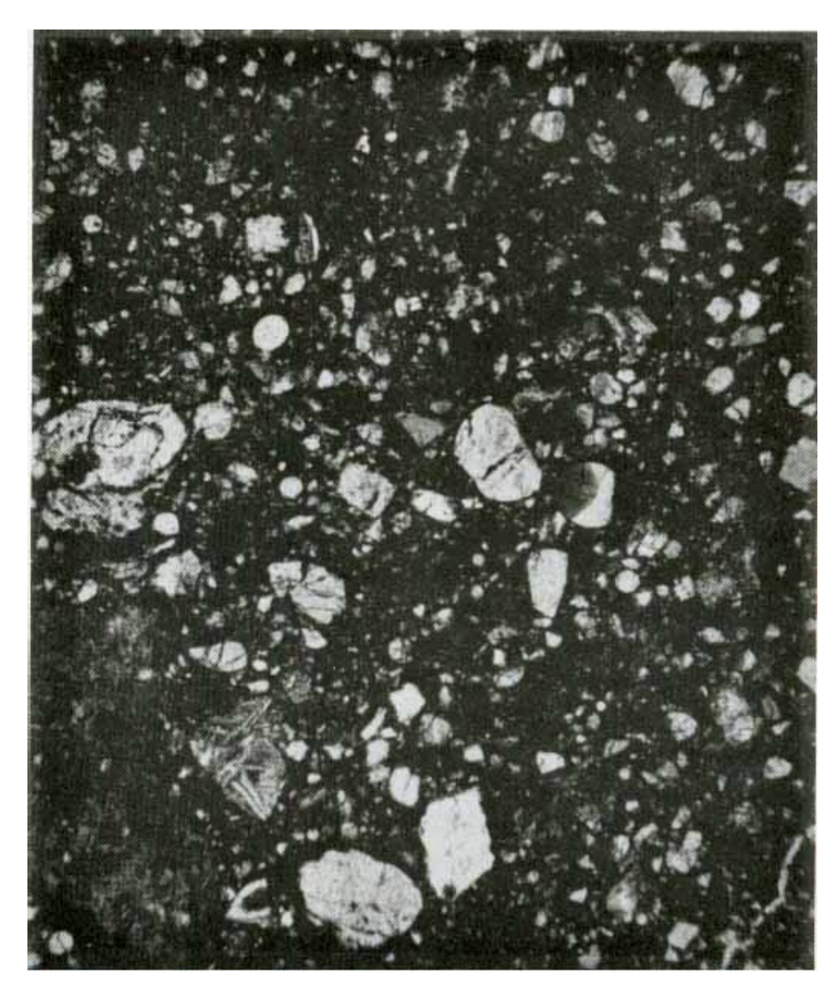
Figure 2. Photomicrograph of general matrix of 15335,6. Transmitted light. Width about 2mm.