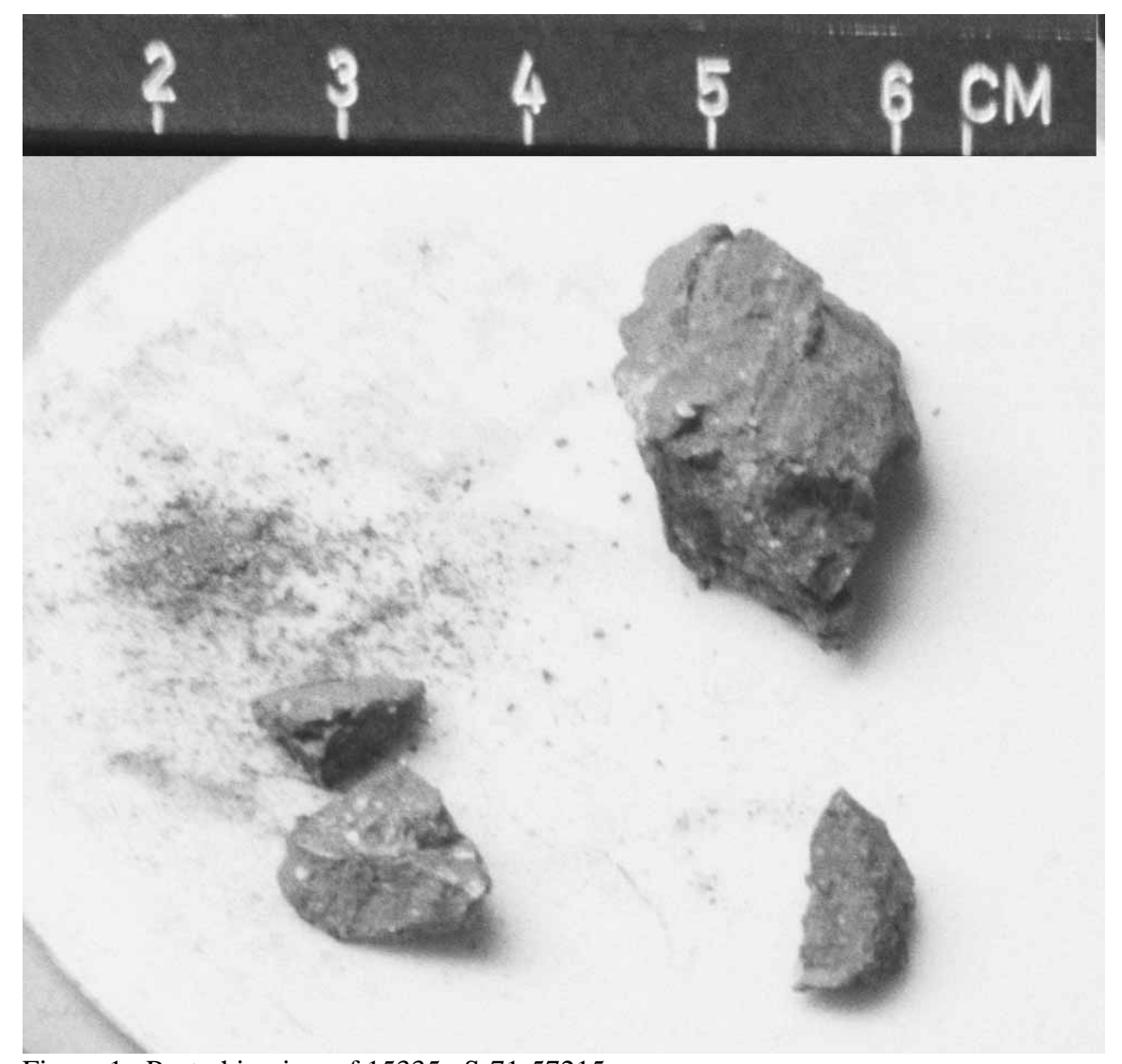
Figure 1. Post-chip view of 15335. S-71-57215

<u>INTRODUCTION</u>: 15335 is a moderately friable, brown-gray regolith breccia (Fig. 1). It had apparent fresh fracture surfaces on both ends, and glassy slickensides on one surface. No zap pits were obvious. The sample was collected as part of the rake sample from the north-east rim of Spur Crater.