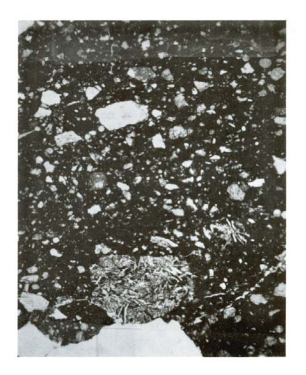
Figure 2. Photomicrograph of 15289,6. Width about 2 mm. Transmitted light. Clast in lower center is a mare basalt.