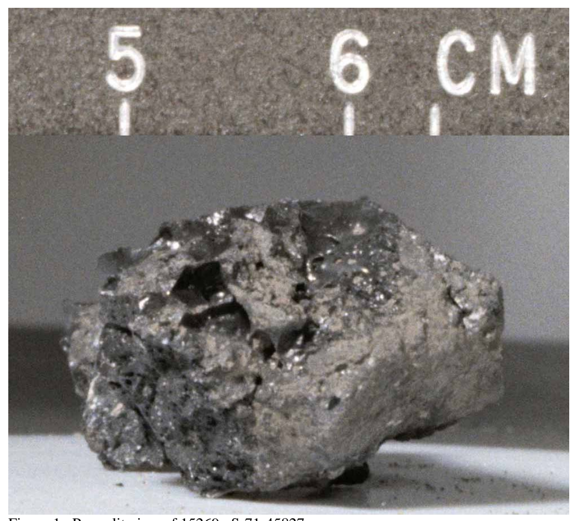
Figure 1. Pre-split view of 15269. S-71-45827

<u>INTRODUCTION</u>: 15269 is a glassy regolith breccia with a vesicular glass coat (Fig. 1). It is tough, grayish black, and prismatic or angular. The glass coat is black. The contact of glass coat and glassy breccia is locally sharp, but elsewhere they grade, either rapidly or through a porous, sintered zone. The appearance is of melted breccia, not splash glass. 15269 was collected (with 15259, 15265 to 15268, and 15285 to 15289) from the crest of an inner bench on the north-east wall of the 12 m crater 15 m downslope from the LRV. Like 15268, it was lying very close to 15265-15267 and may have spalled from it.