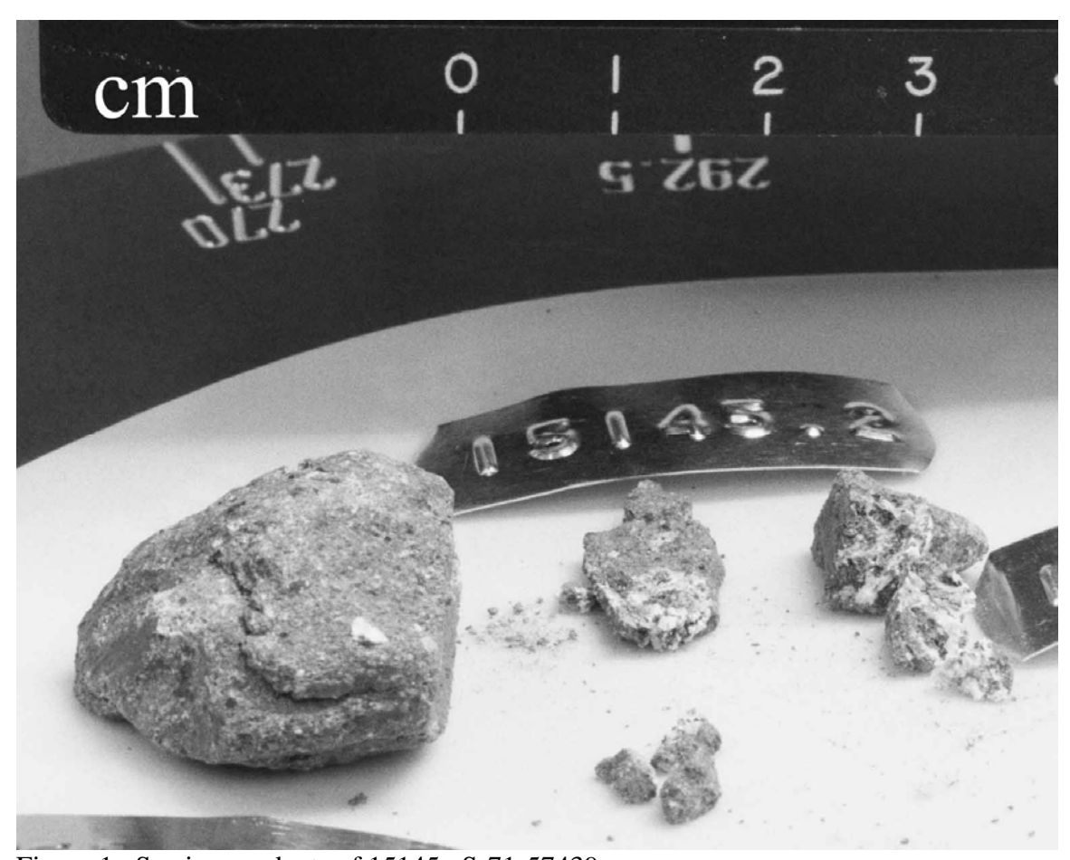
Figure 1. Sawing products of 15145. S-71-57439

<u>INTRODUCTION</u>: 15145 is a breccia which appears to be almost monomict and formed of coarse mare basalt clasts. It is light gray, subangular, and tough (Fig. 1). One piece of surface area is slickensided and has a little splash glass. Zap pits occur on this and other surfaces. 15145 was collected as part of the rake sample 5 m east of the boulder at Station 2 (See Fig. 15105-2).