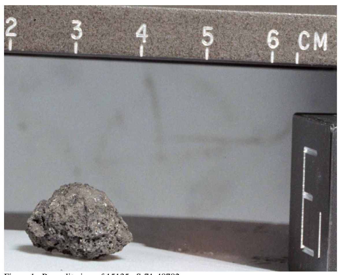
Figure 1. Pre-split view of 15135. S-71-48782

<u>PROCESSING AND SUBDIVISIONS</u>: 15135 was sawn to produce ,1 (Fig. 3) from which thin sections ,6 to ,8 were made.