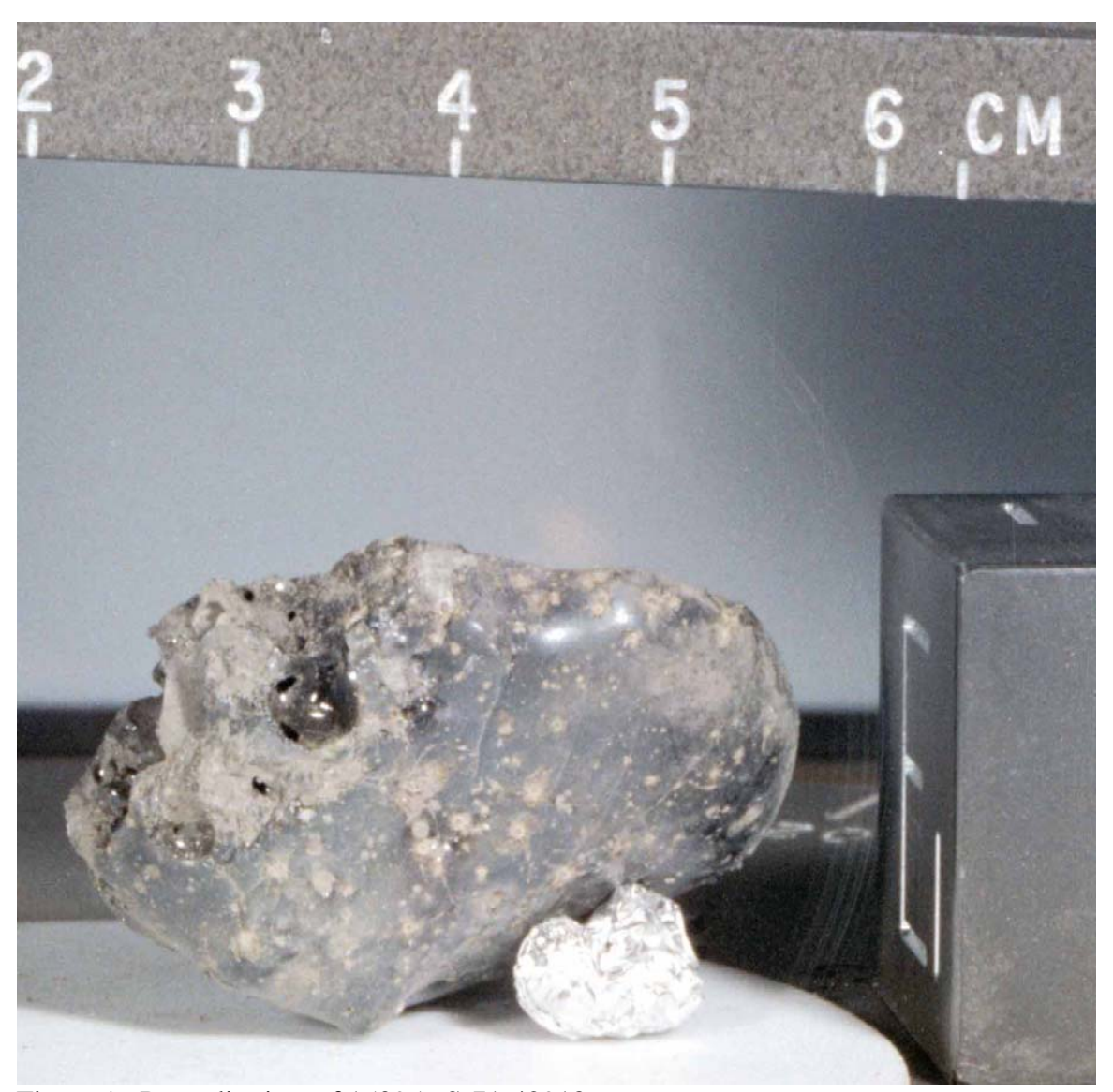
Figure 1. Pre-split view of 15095. S-71-42918

<u>INTRODUCTION</u>: 15095 consists of a light gray breccia largely enclosed in a round, smooth-surfaced glass (Fig. 1). The glass is medium dark gray and vesicular. The breccia contains lithic and mineral clasts, appears to be polymict, and lacks regolithic materials. The sample is tough and the glass makes it rounded except where broken. There are many zap pits on the glass. 15095 was collected near the large boulder at Station 2.