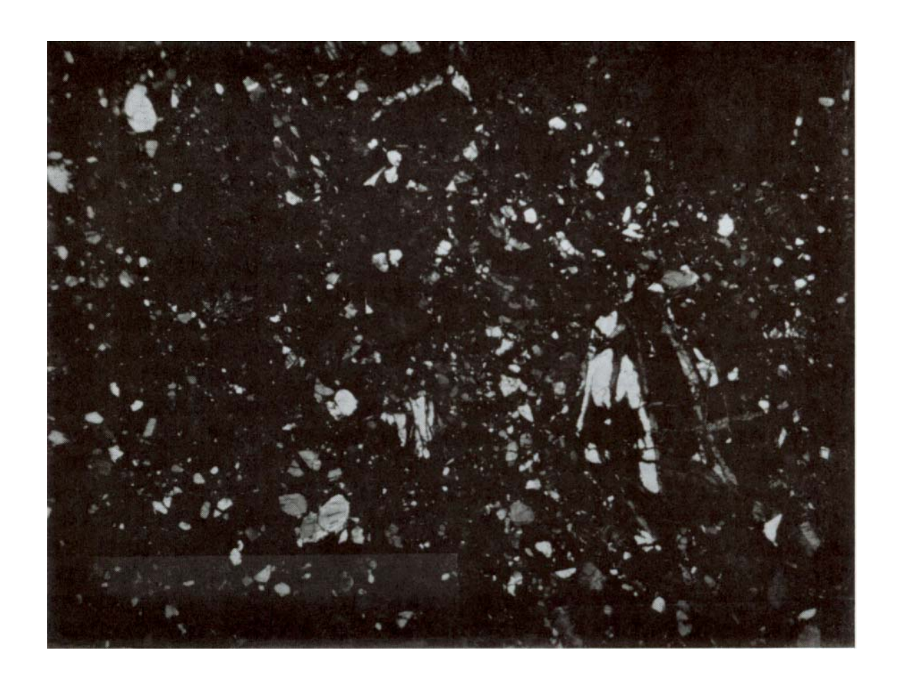
Figure 2. Photomicrograph of breccia portion of 15095,4. Crossed polarizers. Width about 1.25 mm. Photograph is dark because of extreme thinness of the section.

<u>PROCESSING AND SUBDIVISIONS</u>: Only an exterior chip ,1 was removed (Fig. 3) to make thin section ,4.